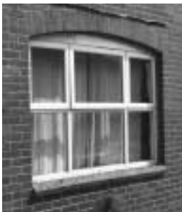
Incorrect construction using conventional DPC. Introduced in the first available horizontal run, this arrangement is suspect because it leaves a considerable amount of brickwork between window and DPC which is unprotected.

The Type BA barrier arch is a DPC, supplied ready-shaped to suit the arch opening. The Type BA is incorporated within the cavity wall with its base section positioned on the traditional centring.