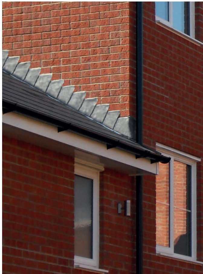
Type CRSS Continuous Running Soaker Strip at slate/wall junction with Type X Cavitytray flashings dressing over CRSS upstand

Incorporate where sloping slate roofs intersect masonry walls. Metres run _____.