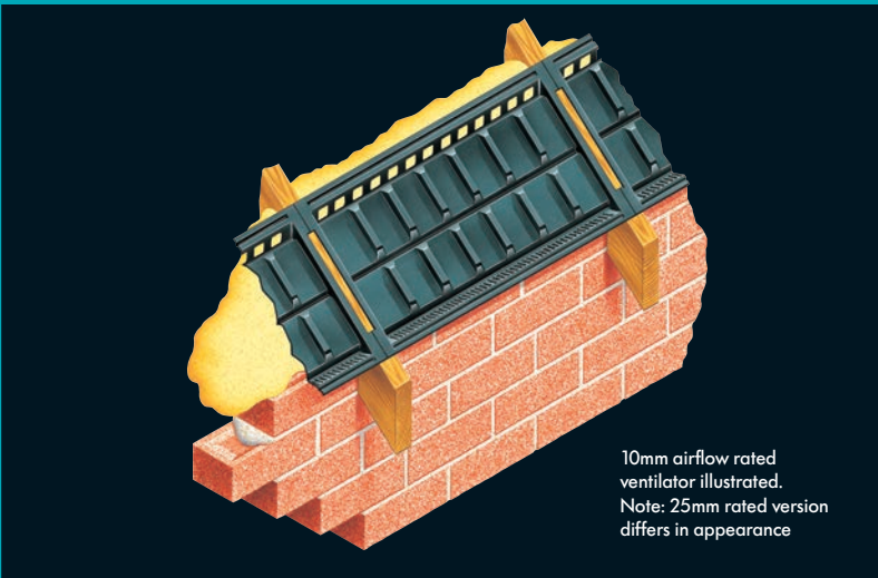
10mm airflow rated ventilator illustrated. Note: 25mm rated version differs in appearance